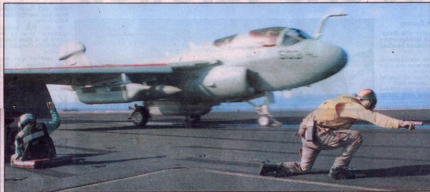
An EA-6B Prowler takes off from USS Carl Vinson in the Gulf ... President Bush has ordered the terror network be destroyed at all costs