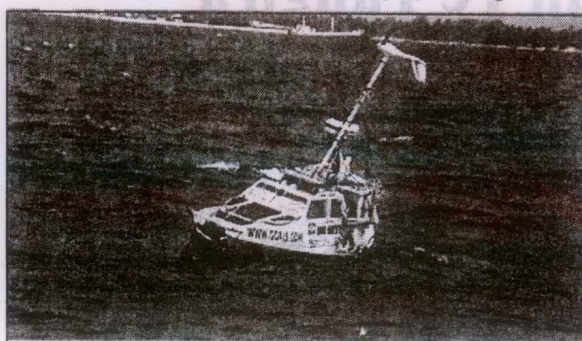
The Moksha as it enters Tarawa lagoon

Story by Iaram Tabureka