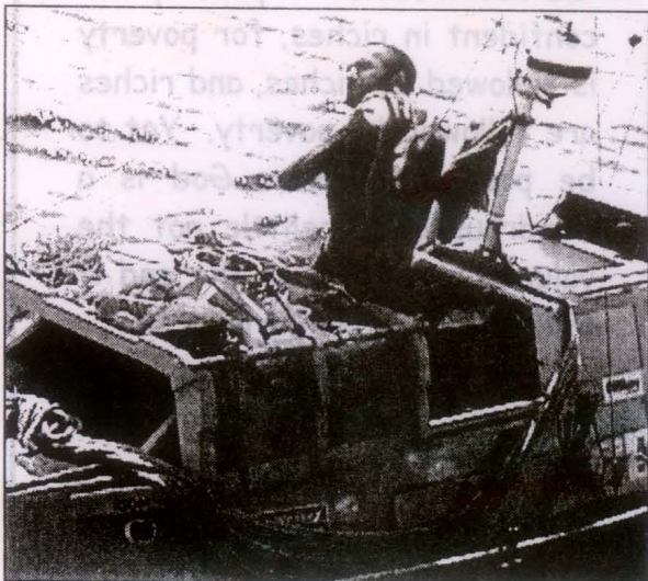
Cooling himself with fresh water as he berthed alongside the Betio Jetty

He leaves Tarawa for the Solomons in two weeks time then pedalled his way to Brisbane in Australia before heading for home in England.