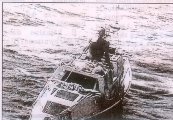
Quenching his thirst after a hard day's pedalling